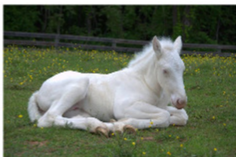
Triple Springs Lady Eleanor # 760 May 9, 2016