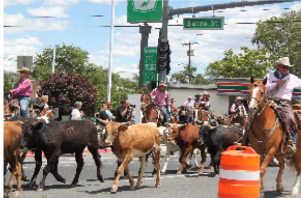
Head 'Em Up, Move 'Em Out