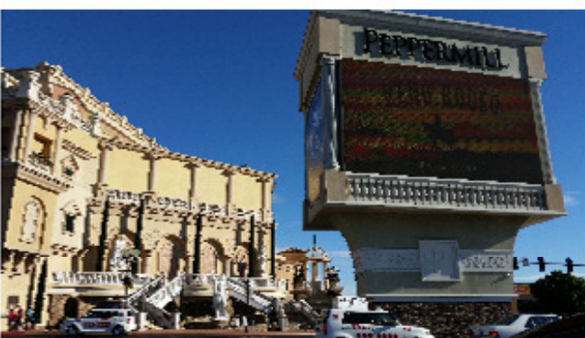
Luxury at it's finest, Peppermill Casino and Spa