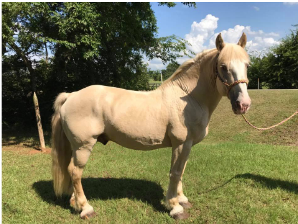
Texas Rescue Stallion has been Identified! He is a full-registered American Cream