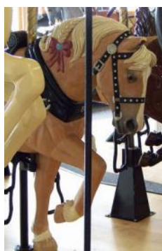
Cream draft horse on the Carousel at Shipshewana's Davis Merchantile